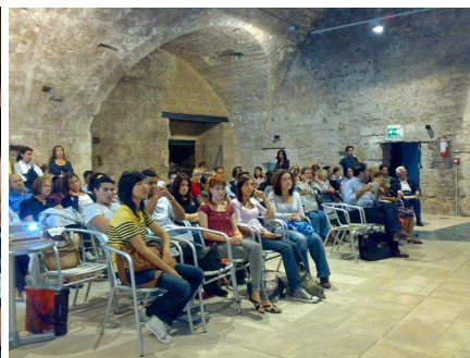
IDD event in Trani