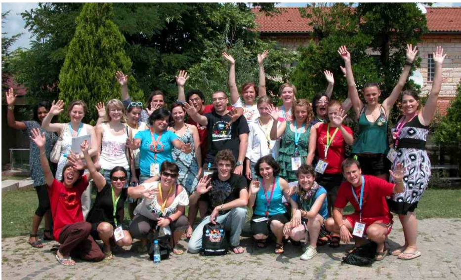
Volunteers Coordinators meeting at the EFIL Volunteer Summer Summit in Istanbul, Turkey (August 2009)

On that day, AFS volunteers in 20 countries have made a joint effort to set up simultaneous activities, including school and creativity workshops, youth de-