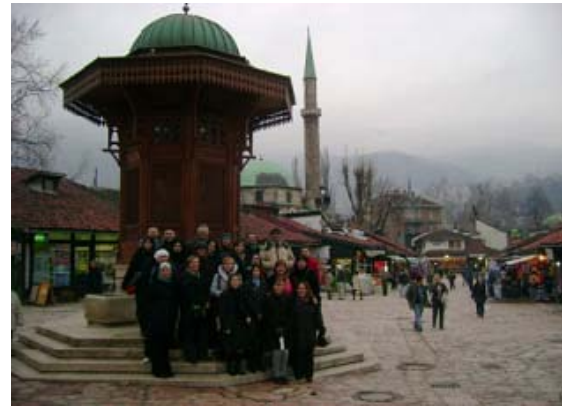
Programme Directors meeting

large. Look out for further announcements from EFIL and AFS INT, updating you on the current situation with the new partners organisations in South Eastern Europe.