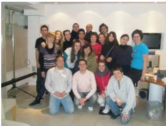
Volunteer Training, Sarajevo

An interactive programme had been put together. Participants were able to ask the experienced AFS trainers questions about chapter development and organisational structure. In a special session "Meet the Programme Director" the volunteers had an opportunity to talk to the Programme Director of AFS France and get to see the office perspective of their AFS work.