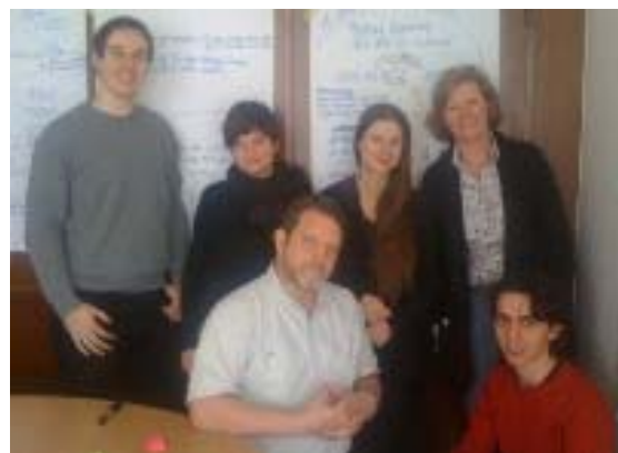
Preparatory Meeting

The idea of this event is to bring together about 25 participants - volunteers and staff from within AFS network (primarily from Europe) who deal with different aspects of Intercultural Learning within the organisation. The 5 days of seminar will focus on a deep reflection and debate on the AFS situation in ICL, confronted in addition with the external developments in the field.