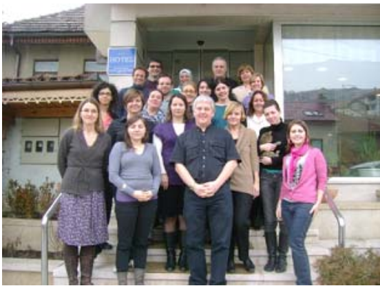
Programme Directors meeting

Programme Directors meeting. The programme included an overview of the mid- to long-term EFIL activity calendar and a discussion following the evaluation of the first European Citizenship Trimester Programme and the Brussels end-of-stay camp, which took place at the end of 2009. Further topics included Youth Pass and Mobility Pass, the challenge of participant growth and quality, and several other matters of interest, bundled in an Open Space session on Wednesday afternoon.