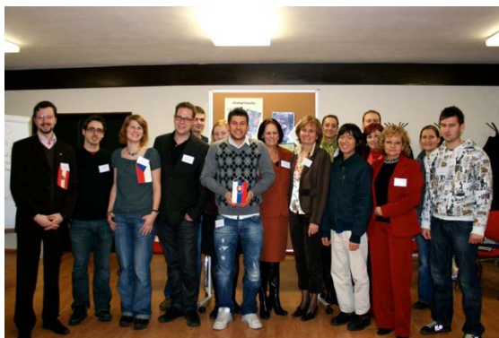
Volunteers from Austria, Czech Republic and Slovakia

Since the closing down of AFS Slovakia at the end of June 2009, plans are emerging to revitalize the organisation, with the support of AFS Czech Republic and AFS Austria.