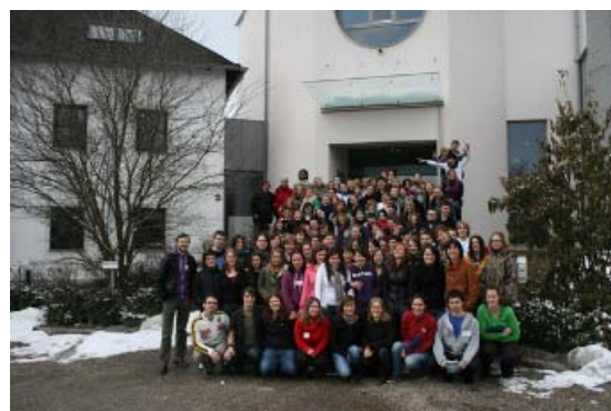
Megaworkshop 2010

On the weekend 5-7 March 2010, 115 volunteers, staff and board members met in Linz/Steyregg for AFS Austria's biggest annual national volunteer training event, the Megaworkshop 2010.