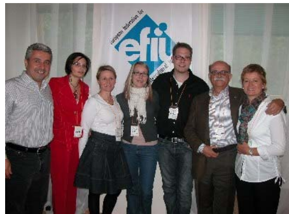
EFIL Board at the GA in Moscow

The EFIL Board continued its discussion "what about the remaining 99%", referring to the large group of young European pupils that are currently not involved in any form of mobility. In a brain storming session the following corner stones were identified: a strong volunteer network; strong leadership; appealing programmes and activities; strong school relations; financial stability, fundraising. EFIL plays a role in helping the Partners to build up these corner stones and reinforce them as 'drivers' of our organisations, by providing trainings that help motivate and educate all levels of the organisations (leaders, volunteers); by providing social networks on international level; by stimulating sharing between Partners, including the exchange of good practices; by looking for European funding; etc.