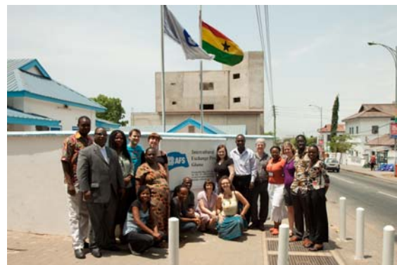
EurAfrica-Team Ghana

Over the weekend, a training for volunteers took place in three regions in Ghana, this way reaching as many local volunteers as possible. Altogether, in Accra, Cape Coast and Sunyani, some 50 volunteers attended the trainings, which covered a wide range of topics such including volunteer motivation, promotion of AFS, intercultural learning, hosting and finding host families, recruitment and selection of participants, preparations and orientations, etc.