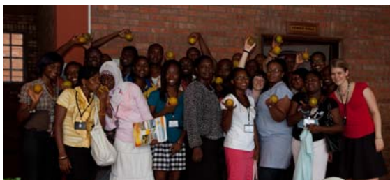
Training in Accra, Ghana

The first of three visits to the African partner countries in the project is taking place in Ghana from 08-19 March 2010. A team of 10 experienced volunteers from AFS organisations in Latvia, Finland, Hungary, Italy, Austria, Germany, Kenya and South Africa arrived in Accra, Ghana, for two weeks of project activities.