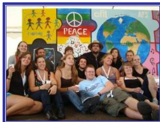
Summer Summit France 2008

In August all roads will lead to Zanka, the meeting point for AFS volunteers coming from all over Europe and beyond for EFIL’s third Volunteer Summer Summit, the ultimate summer event to meet your fellow volunteers from other countries, to finally meet in person those Facebook friends you’ve been communicating with for ages, or to even re-unite with your AFS host family.