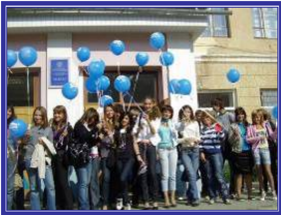
IDD 2009 in Russia

selection of activities in two attractive, colourful 24 pages booklets, reflecting on the IDD events of 2008 and 2009. Please have a look on the EFIL website: http://efil.afs.org/ . Following the success of the first two editions the ultimate goal of IDD2010 is to include as many chapters and locations across Europe as possible. Wouldn't it be great if volunteers in every chapter in 25 countries in Europe were to be involved somehow in the celebration of intercultural dialogue on 30 September 2010?