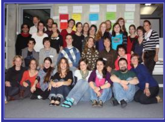
ICL seminar 2010 participants