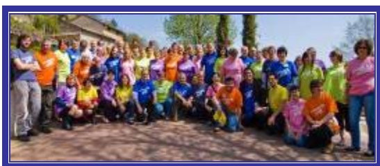
AFS France's volunteers and staff wearing their brand new "Connecting Lives, Sharing Cultures" T-shirts

The French national TV channel France 3 has made a report about one of the AFS France participants currently spending a year in Italy. The report features not only the student herself but also her host family, local volunteers and a teacher. You can watch it online on the TV channel's website by following this link : http://jt.france3.fr/1920/ . Once on the homepage, select "Mardi 27" and move the cursor until 21 minutes 07 seconds.