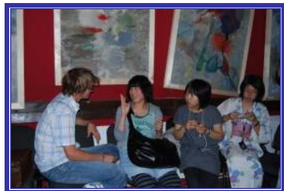
IDD 2009 in Czech Republic

Pisek in South Bohemia will set up three stations with information on AFS and various interactive exercises for the public. Bilovice in Moravia intends to design a path with various tasks on different cultures along the way. Jicin in North Bohemia will focus on a lecture and discussions about Thailand and Asian cultures. A general project to be implemented in several chapters and cities involves creating an intercultural carpet, made up of pieces of clothes sewn together, each depicting an intercultural experience.