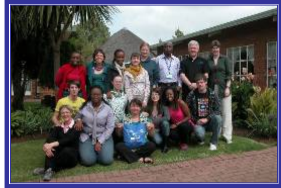
EurAfrica-Team South Africa

motivation, roles and responsibilities of volunteers, promotion of AFS, intercultural learning, hosting and finding host families, recruitment and selection of participants, preparations and orientations, etc.