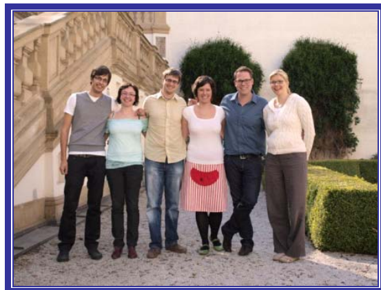
AFS Czech Republic General Assembly