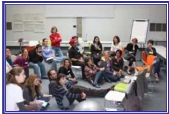
ICL seminar Strasbourg

The seminar “Intercultural Learning and Exchanges – where do we stand?” was a chance not only to get a glimpse of what is going on in the AFS external environment (most of all in the European institutional world) but most importantly to look critically at ourselves and to reflect on ways to keep improving as an educational organisation.