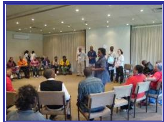
Training in Cape Town

As part of the programme, AFS South Africa had set up appointments with government institutions, private sector, NGOs and local organisations for participants to collect information in the framework of a feasibility study. The feasibility studies in the EurAfrican Partnership for Change project aim at proposing a framework to help empower the AFS organisations in the African partner countries and further support them in their organisational and volunteer development.