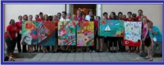
Summer Summit Turkey 2009