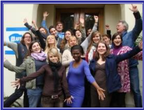
Staff and trainees of AFS France

brand recognition and a need to renew our tools.