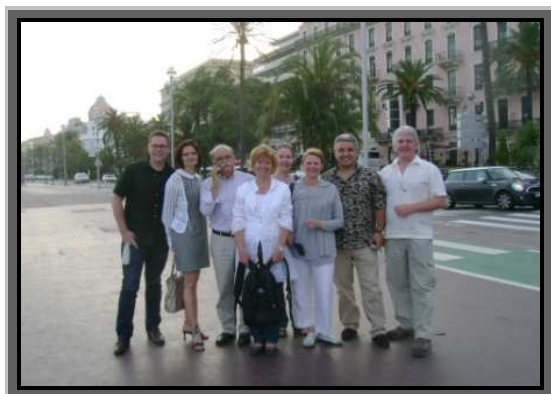
EFIL Board in Nice

The EFIL Board held its second meeting of the year in Nice, 4 – 6 June 2010. The agenda featured a wide range of topics, including an overview by the Secretary General on recent developments in EFIL and in Europe, and EFIL's mid- to long-term activity calendar. The auditor's report 2009 was presented, together with the balance sheet and the final year end results of 2009.