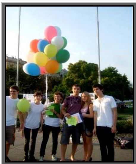
Intercultural Dialogue Day in Croatia in 2009

Are you interested in helping to build up a new and motivated AFS partner organisation? Are you excited to get to know more about South Eastern Europe? Are you up for some real pioneer work? Then this announcement is for you! ☺