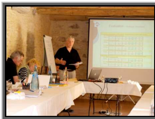
Extra-ordinary General Assembly in Sernhac