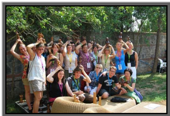
Volunteer Summer Summit in Istanbul, Turkey 2009

Budapest and a community activity at Sziget Festival. We are all working together to achieve one ultimate goal: make it an unforgettable Volunteer Summer Summit for everyone participating!