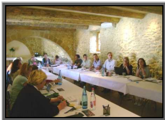
Extra-ordinary General Assembly in Sernhac

On Monday 7 June, an EFIL extra-ordinary General Assembly took place, alongside the Heads of Office meeting in Sernhac, France.