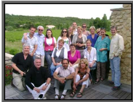
EFIL Partner Directors

In France, 19 Directors of the EFIL Member Organisations met in an extra ordinary setting with a cozy atmosphere, excellent facilities, and great French cuisine for their first of two annual Heads of Office meetings. The event in Sernhac – near Avignon and Nîmes - was a HOO “retreat” rather than a meeting, because of its slightly different focus, and was the first of its kind since the retreat in Sicily in May 2006.