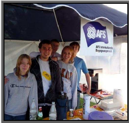
IDD in Bonn 2009