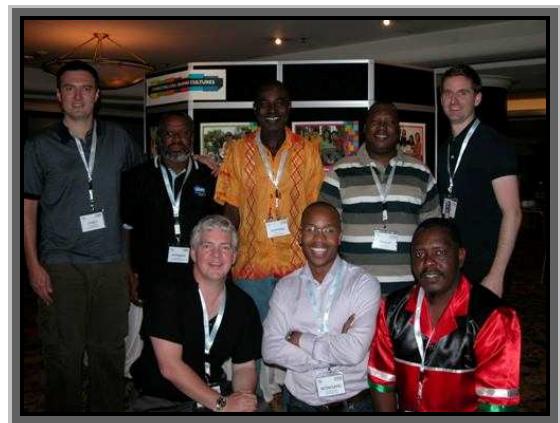
African partners in "EurAfrican Partnership for Change" project, meeting at the AFS World Congress in Malaysia in 2009

Over the weekend, an intensive training for volunteers will take place in three regions in Kenya, this way reaching some 50 local youth workers and multipliers in Nairobi, the coastal region (Mombasa) and the southern Rift Valley (Narok). The trainings will cover a wide range of topics including intercultural learning, volunteer recruitment and motivation, roles and responsibilities of volunteers, hosting aspects and finding host families, recruitment and selection of participants, preparations and orientations, project management modules tailored for volunteer networks, risk management, facilitation and presentation skills, communication and reporting competences, activity planning, etc.