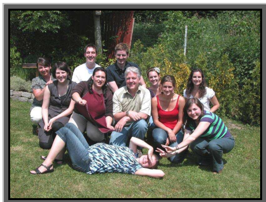
staff & volunteers EFIL Secretariat 2010