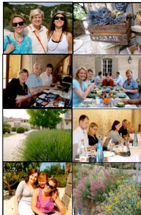
HOO retreat Sernhac