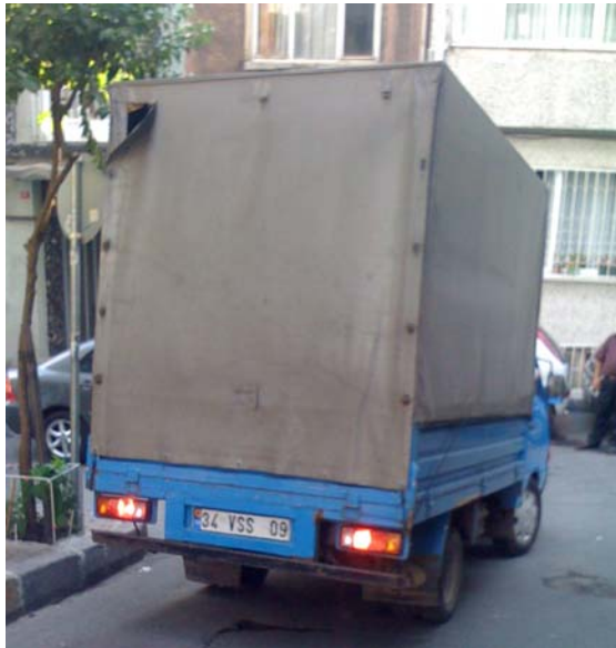
Even the local truck drivers get prepared for the EFIL Volunteer Summer Summit 2009 in Turkey (see registration plate)