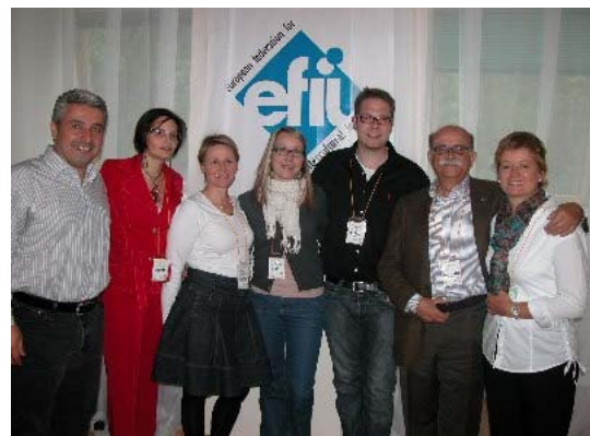
EFIL Board

Wildhaus, Switzerland, was the venue of EFIL's second Board meeting in 2009, which took place on 19-20 June, alongside the annual Alpine meeting of five of EFIL's Member Organisations.