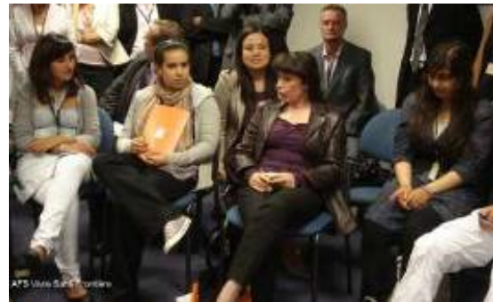
Fadela Amara surrounded by some of the Youth Ambassadors

talk with the new Youth Ambassadors. Part of the workshop focused on diversity issues as the participants represent a wide variety of cultural backgrounds. Ms. Amara urged them to be “ambassadors of their own life” and announced that she would like to meet with them again when they return from the States.