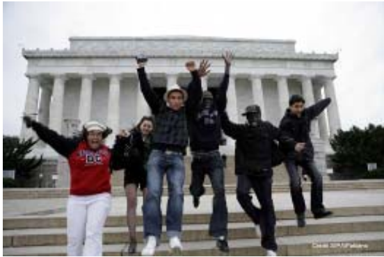
Youth Ambassadors programme AFS France

applicants) from four different regions, mostly suburbs and rural areas, embodying French cultural diversity, all of them students with a strong involvement in their community. They will spend 15 days in the USA (24 October to 9 November 2009), in Washington DC and other cities, where they will live with a host family, go to a local school, visit NGOs, participate in discussions, etc. After returning home they will develop a project related to their stay in the USA that benefits their community.