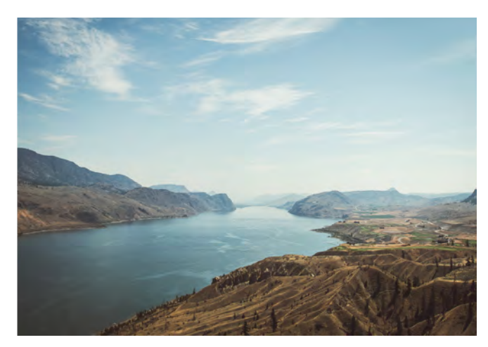
Fun fact: Kamloops is the second largest city in the interior of British Columbia with over 100 lakes within easy reach

Kamloops has a population of 90,000 and is located in south-central interior British Columbia. Kamloops has a semi-arid climate