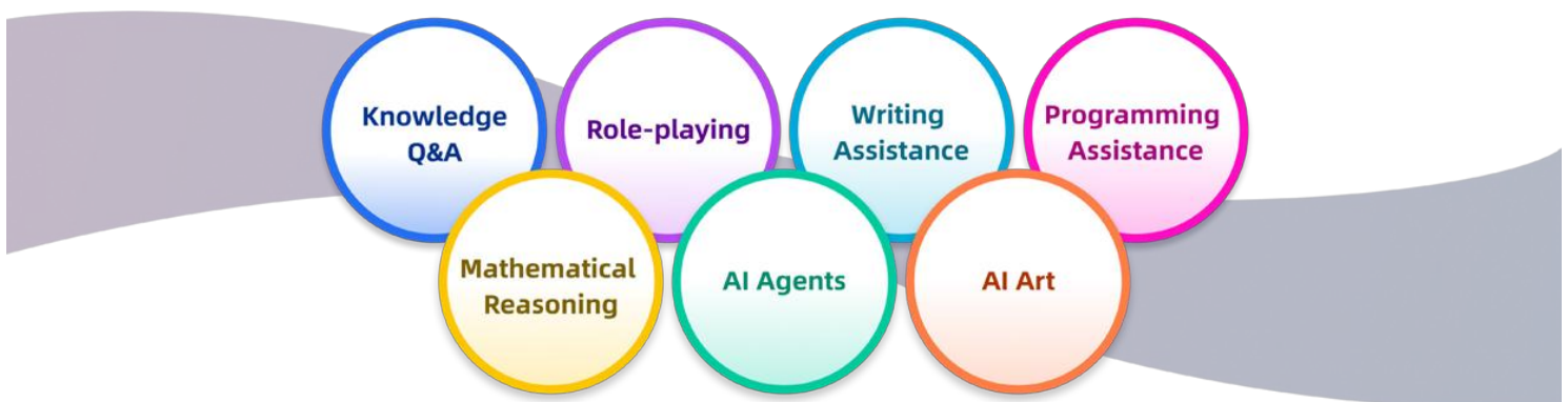
Figure 1. Main Service Areas of Generative AI