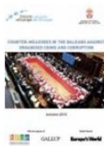
COUNTER-MEASURES IN THE BALKANS AGAINST ORGANISED CRIME AND CORRUPTION