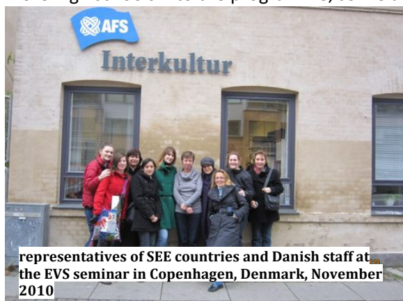
representatives of SEE countries and Danish staff at the EVS seminar in Copenhagen, Denmark, November 2010

There are two AFS local chapters – one in the capital city of Ljubljana, and the other in Maribor, the second largest city. Most of the AFS activity is still centered in Maribor in the north-east of the country. Every new exchange season we manage to cover more regions of the country and include more high schools into the programme, so we are expanding successfully.