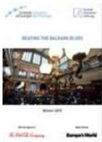
BEATING THE BALKANS BLUES

Friends of Europe's , an independent think tank for EU policy analysis and debate, and co-organisers of the Summit in Brussels, has issued two recent publications on the Balkans: