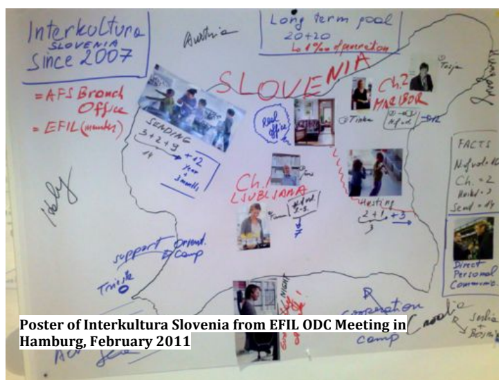
Poster of Interkultura Slovenia from EFIL ODC Meeting in Hamburg, February 2011

Last year we responded to the kind invitation of AFS Denmark and together with representatives of the AFS organisations in our neighbours Croatia, Serbia and Bosnia and Herzegovina, we attended a preparatory seminar on EVS (European Voluntary Service), where we were briefed on how to start the EVS programme in Slovenia. Right now we are in the process of obtaining the accreditation, with foreign volunteers eager to come to Slovenia standing in line.