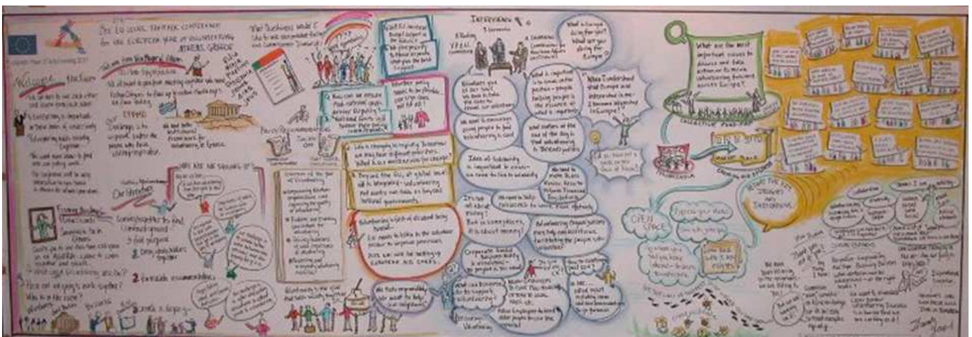
Wall report of the proceedings of the first day of the conference ( www.talkanddraw.com )

The discussions strongly highlighted in various ways the importance and impact of voluntary activities as well as their added value, but also exposed the existing barriers