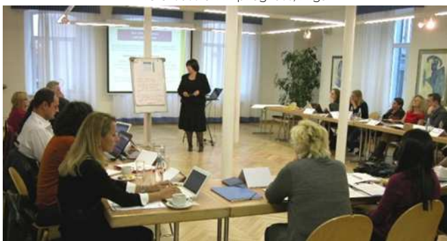
HOO session in progress, Riga