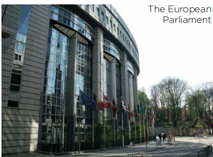
The European Parliament

The 2011 European Citizenship Tri-semester Programme (ECTP) is coming to an end, reaching its climax at the Brussels Camp, where for the close to 200 participants