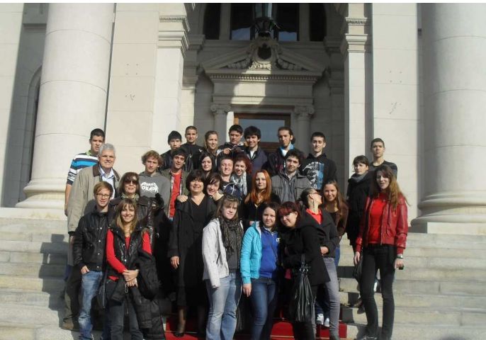
Outside the Parliament

booked for Zorba the Greek musical in one of Belgrade's theatre, a first visit to the theatre ever for some of the students. The students' level of Serbian may not be all that great after only two months in the country, but the universal language of music and dancing was easy to