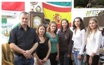
With volunteers in Iasi, Romania