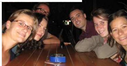
With EVS volunteers in Iasi, Romania