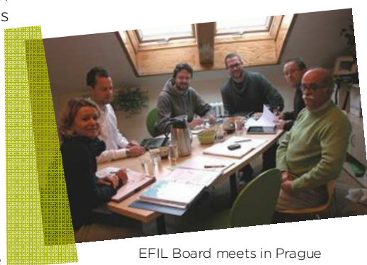
EFIL Board meets in Prague