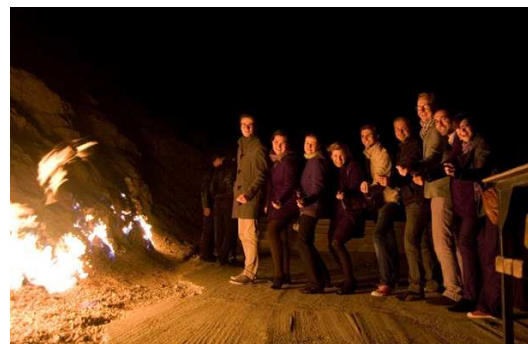
Youth in Action Expert Group at the famous Burning Mountain (Yanar Dagh) in Baku

workers we will be able to secure the future of European funding for the youth programmes, so please stay tuned for further calls for action in the near future!