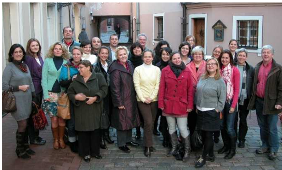
European Directors meet in Riga, Latvia

The programme included an update on EFIL's main activities (past and future), with a discussion of the evaluation of the June events in Vienna (HOO meeting and EFIL's biennial General Assembly), the European calendar of activities, an update on new partner development, and an overview of the main advocacy initiatives that EFIL currently is involved in (with focus on the new generation of EU programmes "Education Europe" 2014-2020. A separate session focused on the European Citizenship Trimester Programme, one of EFIL's flagship pro-