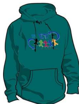
Spectacular 2011 ECTP Hoodie sweater

EFIL has arranged for special ECTP hoodie sweaters for each student to face the winter in Brussels and form a real European team! The preparatory team, the workshop trainers and the support teams are working hard for the preparation of the last content and logistical matters and can't wait to welcome on Sunday 27 November the 183 students and walk together with them through this European experience.