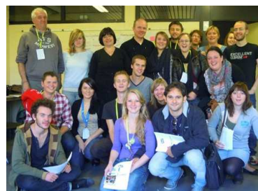
Focus on Balkans at BFL volunteer week-end