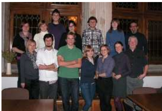
Meeting with some of the Polish volunteers (Global Citizens)