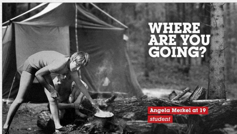
A post-card of the European Youth Forum campaign