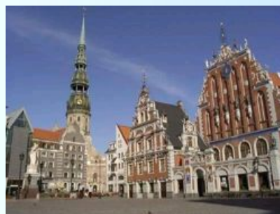
Riga, capital of Latvia