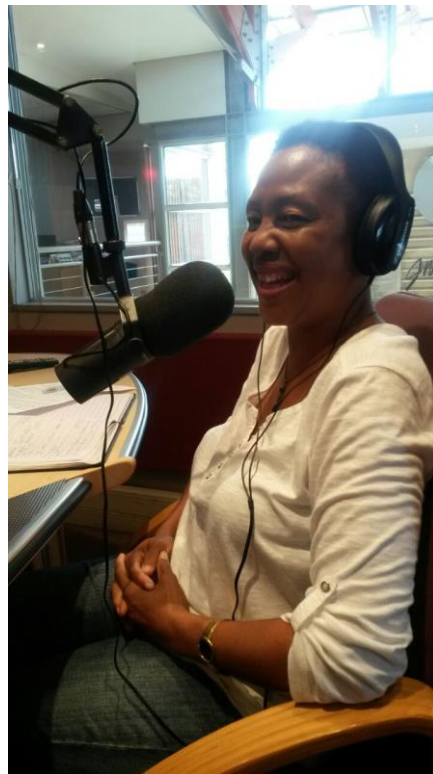
Mamelodi FM: Stakeholder / Relationship building