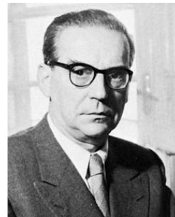
Ivo Andric, writer and Nobel Prize winner