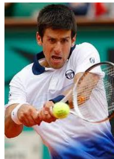
Novak Djokovic, world's no. 1 tennis player