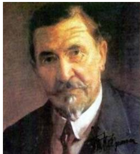
Stevan Stojanovic Mokranjac composer