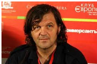
Emir Kusturica, film director