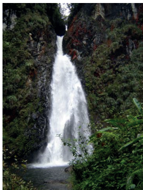
Private Natural Reserve Ram Tzul Ruta a Coban,, Guatemala