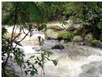
Private Natural Reserve Buenos Aires, Retalhuleu, Guatemala

Our Vision is to be an autonomous, decentralized leader, representing the largest diversity of ecosystems and landowners. Its members will be supported and stimulated to conserve and use natural resources in a sustainable manner. Its effective and innovative action, based on principles and mysticism of work, permit a positive influence in the creation of environmental policies, actions, and initiatives in the private and public sectors.